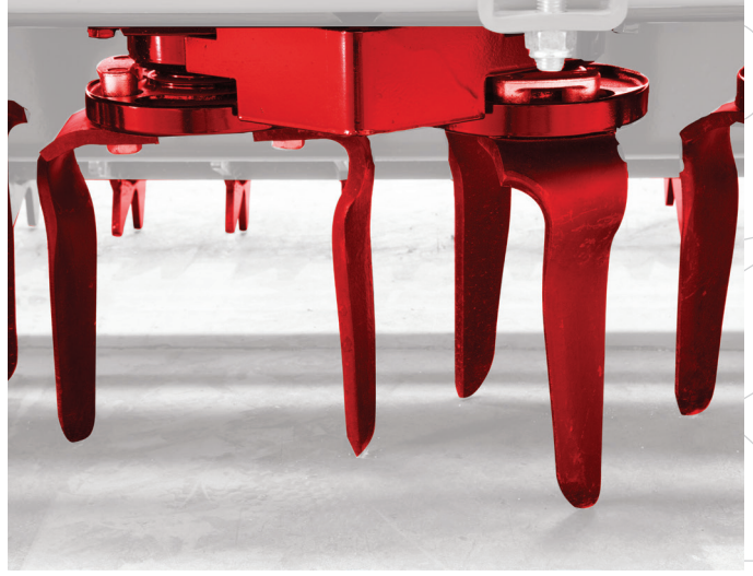
2 BİÇAKLI ROTOR