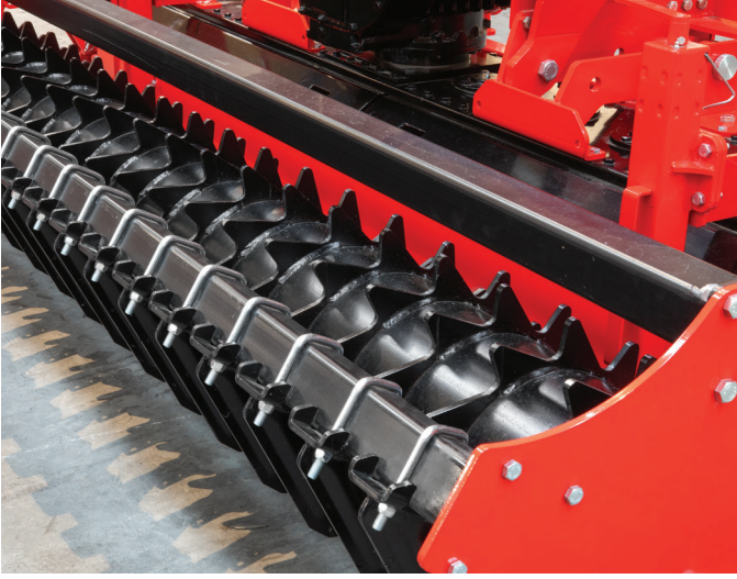
320 MM ÇİZEL MERDANE